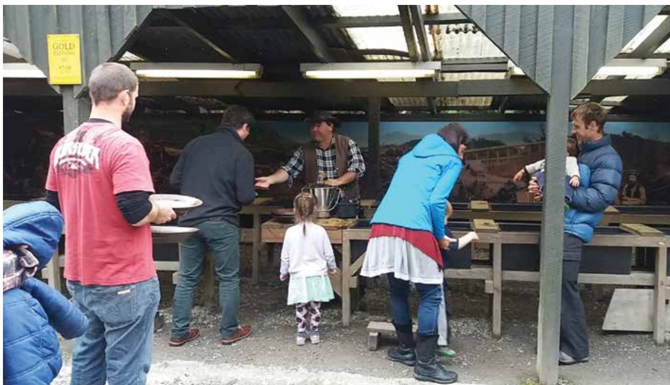
Gold panning in Shantytown.

Thank you to all the families and children who attended.