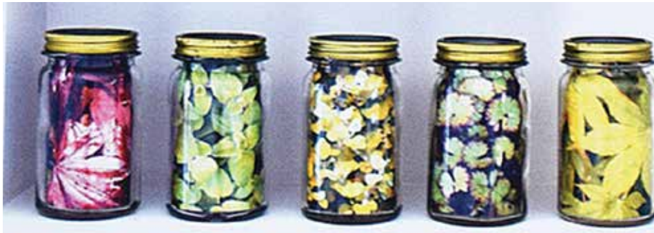
Alice Elcoat Applied Science Photography and Sculpture installation, Year 12