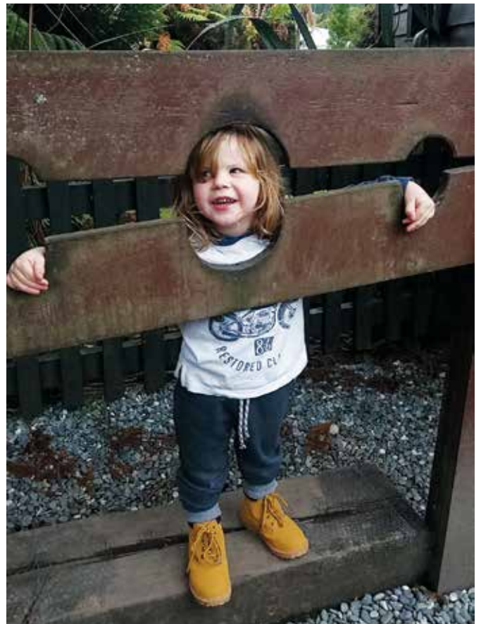
Vinnie gets locked up in Shantytown.