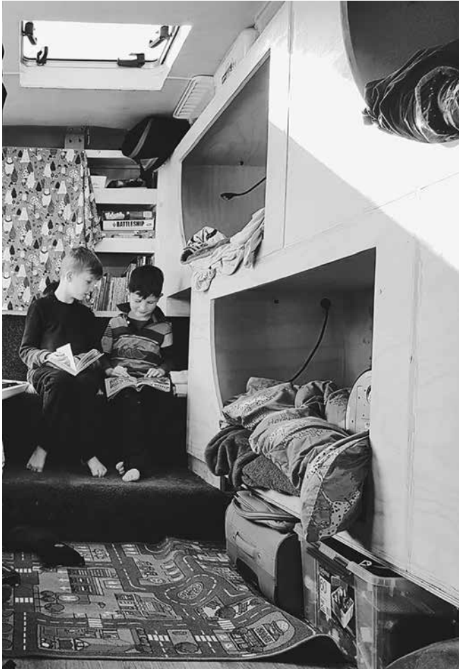
A new take on an old school bus.

They've received lots of help from members of the Te Awamutu community with many donations to help with the bus and film gear.