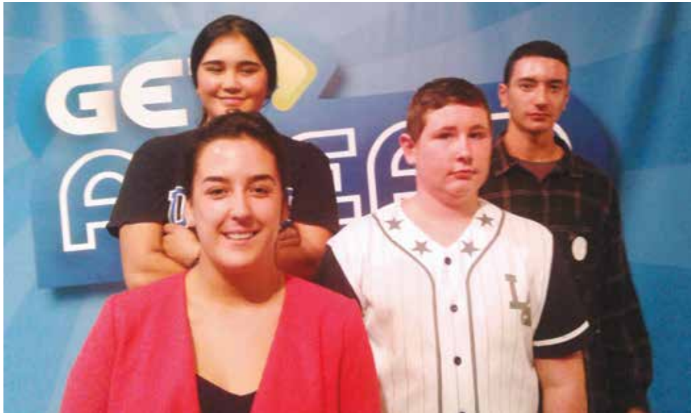
Te Kura students learned all about the agriculture industry at Get Ahead Day.