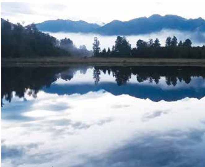
Lake Matheson at dawn.