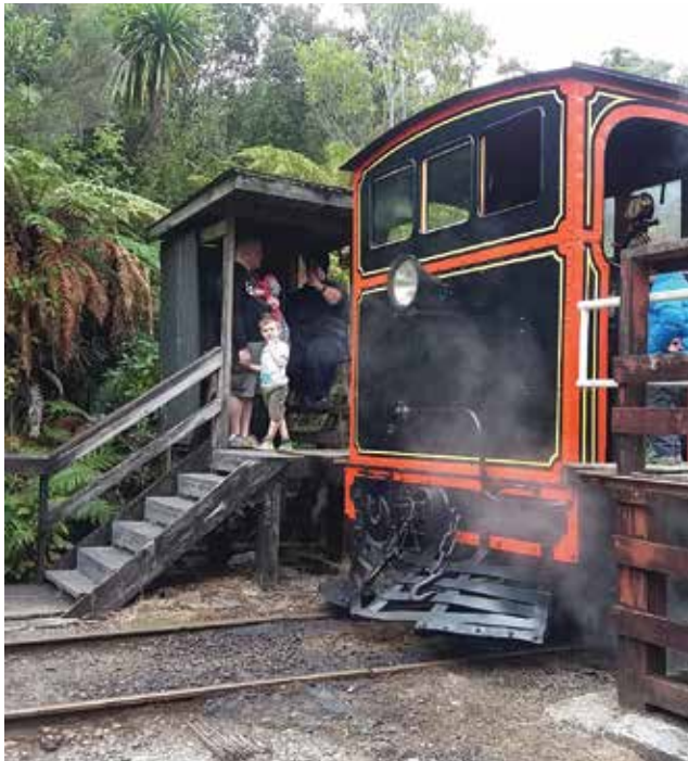
Steam train at Shantytown.