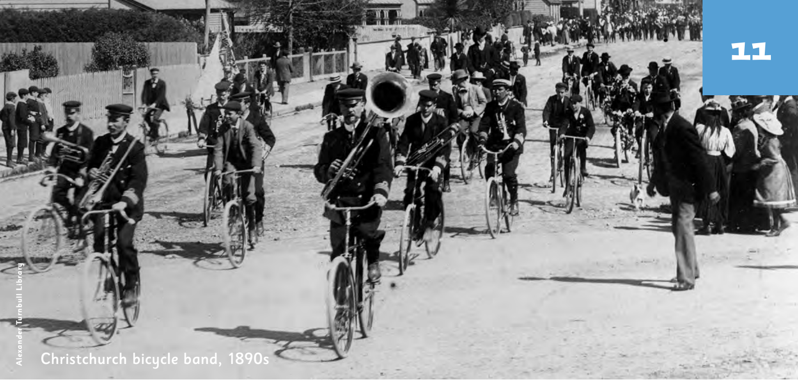
Alexander Turnbull Library